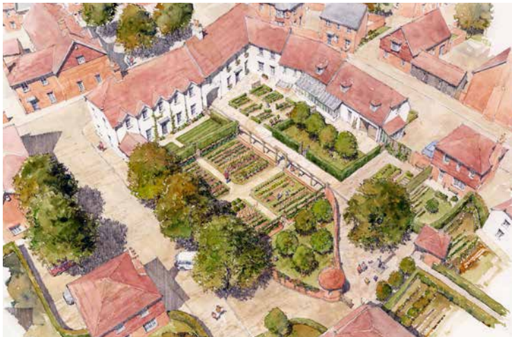
Artist's illustration of a vegetable garden in Phase Two

Community vegetable growing potagers and orchards, new public open spaces and children's play area, will all promote a happy, healthy environment in which to live.